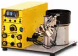
Universal Stud Feed Unit